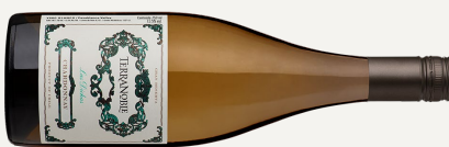
LAS DICHAS 2022 Chardonnay