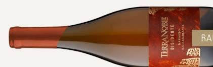
DISIDENTE NARANJO 2022 Pinot Blanco