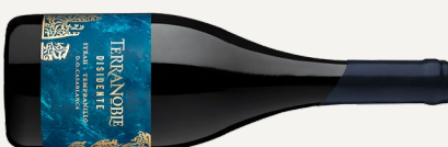
DISIDENTE 2020 Syrah · Tempranillo