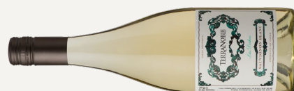
LAS DICHAS 2022 Sauvignon Blanc