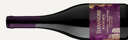
DISIDENTE 2020 Carignan · Mourvedre · Garnacha