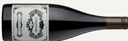
LAS DICHAS 2019 Pinot Noir